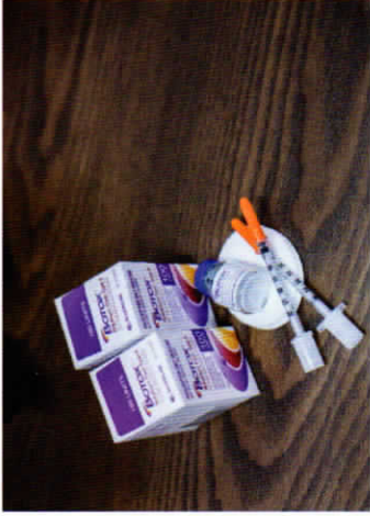
Dr Pascoe uses Allergan Australia Botox. You can expect results to last approximately 3-4 months.